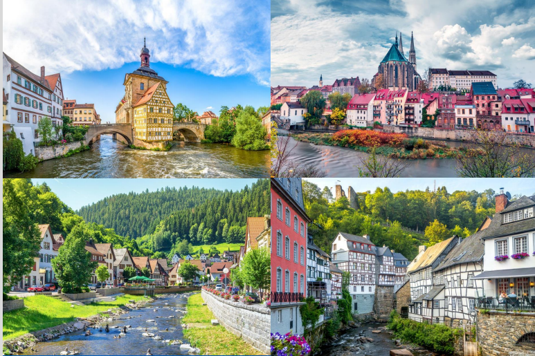
Bridges / Rivers / Stepping Stones